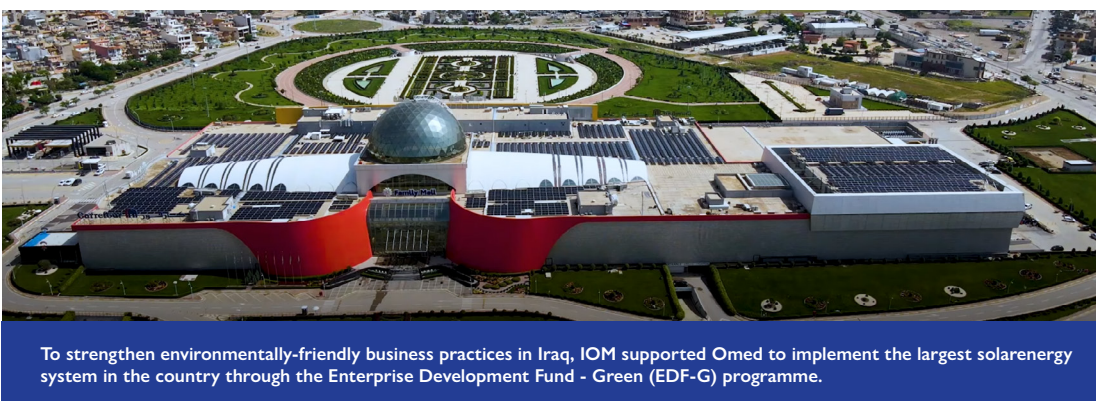
To strengthen environmentally-friendly business practices in Iraq, IOM supported Omed to implement the largest solarenergy system in the country through the Enterprise Development Fund - Green (EDF-G) programme.

Buying of used and older machinery less appropriate due to the lower energy efficiency in some cases.